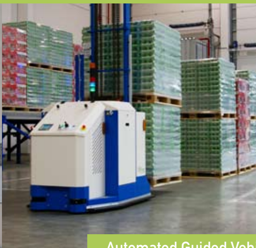
Automated Guided Vehicles